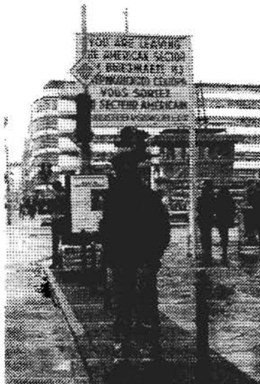
Picture: One of our editorial team while searching for copy to include in this issue.